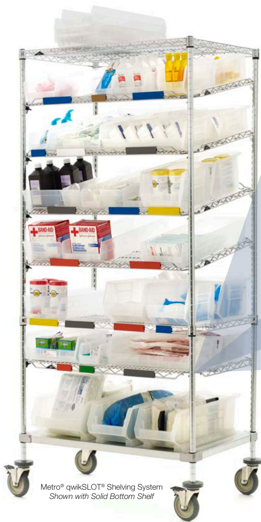
Metro® qwikSLOT® Shelving System Shown with Solid Bottom Shelf