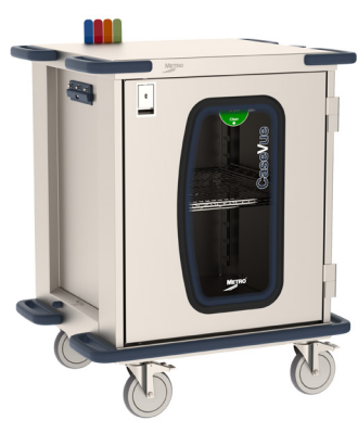
CV24LC-NBF Shown with (1) CV2424W wire shelf