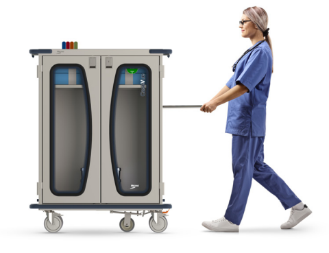
Handle swings up to ideal height.