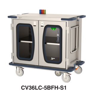
Model 36 (45 1/2" L)