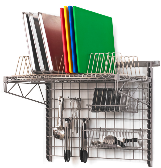
XTR2436XE Shown on a Smartwall unit atop of Super Erecta Shelving in Metroseal Gray.