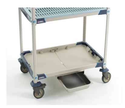
Drip Tray Mounted to a MetroMax i 24x36" (610x914mm) Frame. Steam Pan not included.