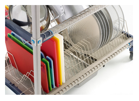
Mounted to 24x48" (610x1219mm) Open Frame with Tray Rack. Steam Pan not included.

Tip: Mount tray and pan racks on an open frame over the drip tray for maximum water collection.