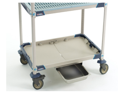
Mounted to 24x36" (610x914mm) Frame. Steam Pan not included.