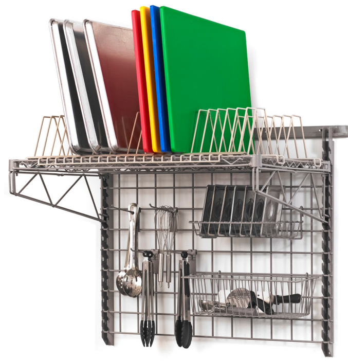
XTR2436XE Shown on a Smartwall unit atop of Super Erecta Shelving in Metroseal Gray.