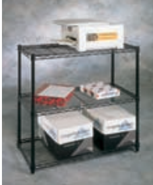
Copy Center Consists of: 18"Dx36"Wx45"H Qty. Cat. No. 3 L1836B shelves 4 L45PB posts