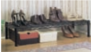
Shoe Rack Consists of: 14"Dx36"Wx7"H Qty. Cat. No. 1 L1436B shelf 4 L4PK7B posts