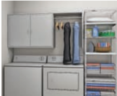
Laundry Center Consists of: 18"Dx24"Wx74"H Qty. Cat. No. 2 L1824W shelves 2 L1824FW solid shelves 3 BSK1824W basket shelves 4 L74PW posts