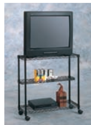
Mobile A/V Cart Consists of: 14"Dx36"Wx37"H Qty. Cat. No. 2 L1436B shelves 1 L836CSB ledge shelf 4 L33PB posts 4 L3BB casters