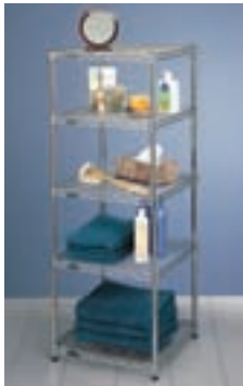
Towel Holder Consists of: 18"Dx18"Wx45"H Qty. Cat. No. 5 L4518C shelves 4 L45PC posts