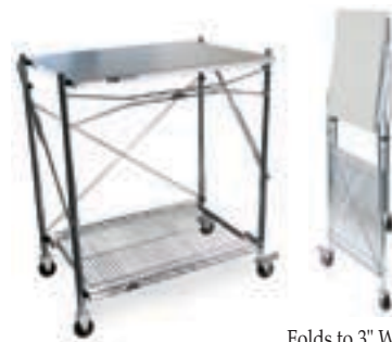
Folds to 3" Wide