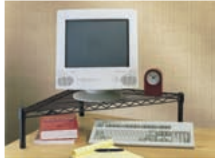
Monitor Stand 18"Dx25"Wx7"H Qty. Cat. No. 1 L18TRB shelf 4 L4PK7B posts