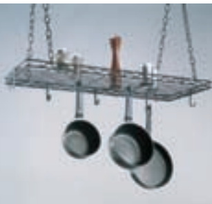
Hanging Pot Rack Consists of: 14"Dx36"W Qty. Cat. No. 1 14"x36" Pot Rack Shelf 8 Hanging Hooks 2 4 ft. adjustable chains Available in black and chrome.