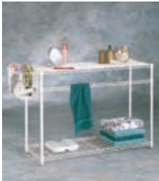
Vanity Unit Consists of: 18"Dx55"Wx34 1/2"H (including accessory) Qty. Cat. No. 2 L1848W shelves 4 L33PW posts 1 LA148W hanger rail 1 LA212W basket