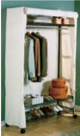
Mobile Armoire Consists of: 18"Dx48"Wx77"H Qty. Cat. No. 4 L1848B shelves 4 L74PB posts 1 AT48NC clothes hanger tube with brackets 1 L18X48X74BE cover 4 L3BB casters