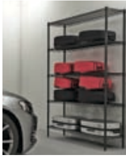
Garage Storage Consists of: 18"Dx48"Wx74"H Qty. Cat. No. 5 L1848B shelves 4 L74PB posts