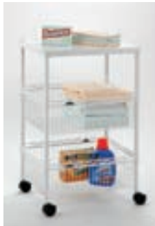
Laundry Mini Folding Cart Consists of: 18"Dx24"Wx37"H Qty. Cat. No. 2 BSK1824W basket shelves 1 L1824FW solid shelf 4 L33PW posts 4 L3BB casters