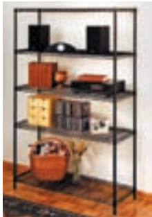
Small Bookcase Consists of: 14"Dx36"Wx54"H Qty. Cat. No. 5 L1436B shelves 4 L54PB posts