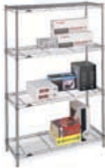
Office Organizer 14"Dx36"Wx54"H Qty. Cat. No. 4 L1436C shelves 4 L54PC posts