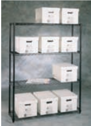
Office Storage Consists of: 14"Dx48"Wx63"H Qty. Cat. No. 4 L1448B shelves 4 L63PB posts