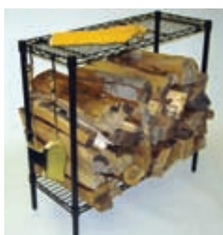
Fire Wood Organizer Consists of: 14"Dx36"Wx33"H Qty. Cat. No. 2 L1436B shelves 4 L33PB posts 1 LHK23B Hook