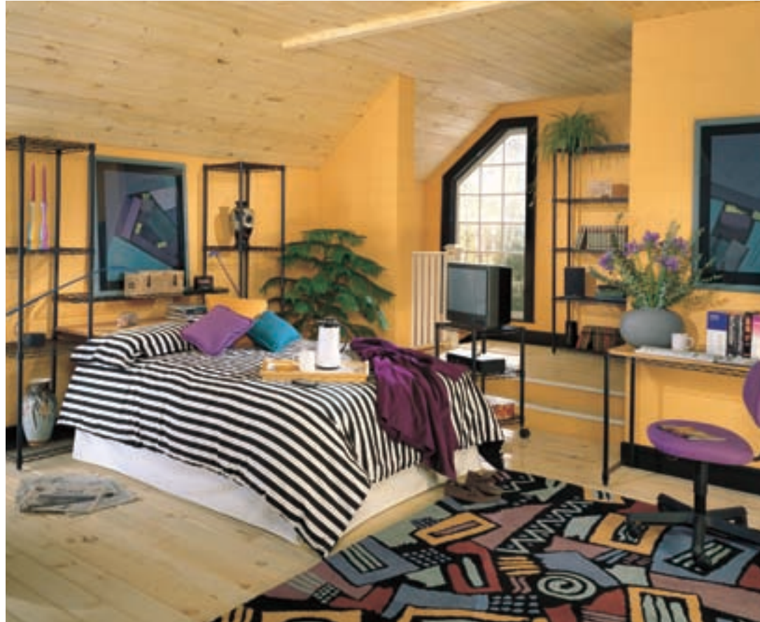
Large Entertainment Center Consists of: 18"Dx48"Wx74"H Qty. Cat. No. 4 L1848B shelves 4 L74PB posts