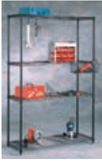
Workshop Rack Consists of: 25"Dx48"Wx74"H (including accessory) Qty. Cat. No. 4 L1848B shelves 4 L74PB posts 1 LHK23B hooks (pkg. of 4) 1 LA210B basket