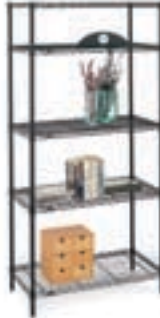
TV Tower Consists of: 18"Dx36"Wx63"H Qty. Cat. No. 5 L1836B shelves 4 L63PB posts