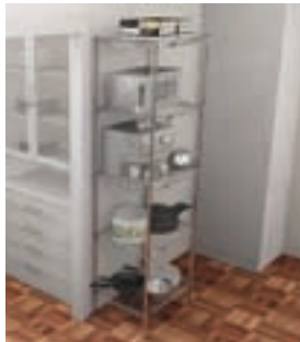
Kitchen Hi-Rise Unit Consists of: 18"Dx24"Wx74"H Qty. Cat. No. 5 L1824C shelves 4 L74PC posts