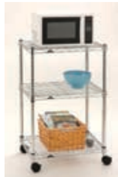
Microwave Cart Consists of: 18"Dx24"Wx37"H Qty. Cat. No. 3 L1824C shelves 4 L33PC posts 4 L3BB casters