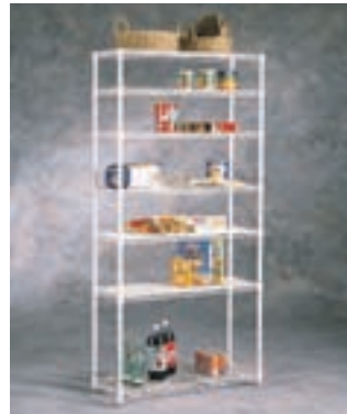
Pantry Tower Consists of: 14"Dx36"Wx74"H Qty. Cat. No. 7 L1436W shelves 4 L74PW posts