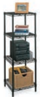
Music Tower Consists of: 18"Dx18"Wx54"H Qty. Cat. No. 4 L1818B shelves 4 L54PB posts