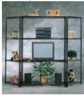
Total Entertainment Center Consists of: 18"Dx84"Wx63"H Qty. Cat. No. 4 L1848B shelves 8 L18TRBshelves 10 L63PB posts 8 L9994B post-to-post connector