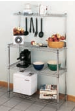
Baker's Rack Consists of: 14"Dx36"Wx54"H Qty. Cat. No. 3 L1436C shelves 1 L836CSC ledge shelf 2 L33PC posts 2 L54PC posts 1 LHK23C hooks (pkg. of 4)