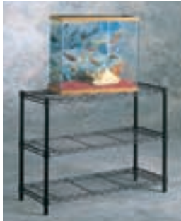
3-Shelf Storage Unit Consists of: 14"Dx36"Wx34 1/2"H Qty. Cat. No. 3 L1436B shelves 4 L33PB posts