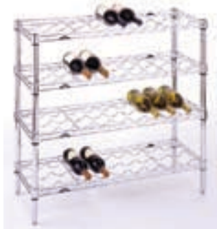
Wine Storage Consists of: 14"Dx36"Wx33"H Qty. Cat. No. 4 L1436C shelves 4 L33PC posts