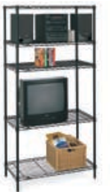
Large Entertainment Center Consists of: 18"Dx36"Wx74"H Qty. Cat. No. 5 L1836B shelves 4 L74PB posts