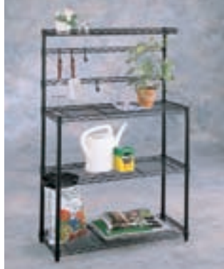
Potting Stand Consists of: 14"Dx36"Wx54"H Qty. Cat. No. 3 L1436B shelves 2 L33PB posts 2 L54PB posts 2 LA136B hanger rails (includes hooks) 1 L836CSB ledge shelf