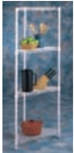
Kitchen Corner Unit Consists of: 18"Dx25"Wx54"H Qty. Cat. No. 4 L18TRW shelves 3 L54PW posts