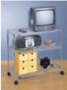
Electronics Cart Consists of: 14"Dx36"Wx37"H Qty. Cat. No. 3 L1436C shelves 4 L33PC posts 4 L3BB casters