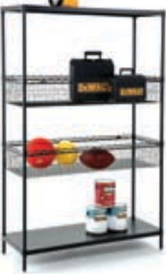
Bulk Storage Consists of: 18"Dx48"Wx74"H Qty. Cat. No. 2 L1848FB solid shelves 2 BSK1848B basket shelves 4 L74PB posts